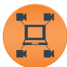
Multi-Input Video Capture