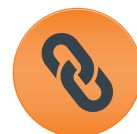
IP PBX and Call Center Integration