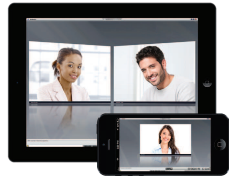
Spontania cloud-based media collaboration