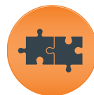
Integration to the Workflow